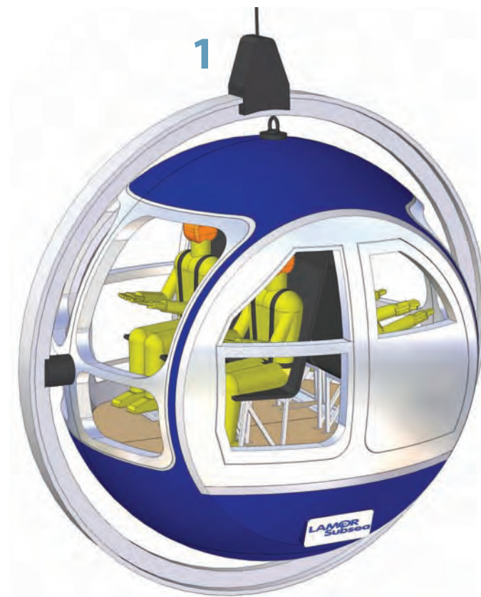
Multiway rotation training